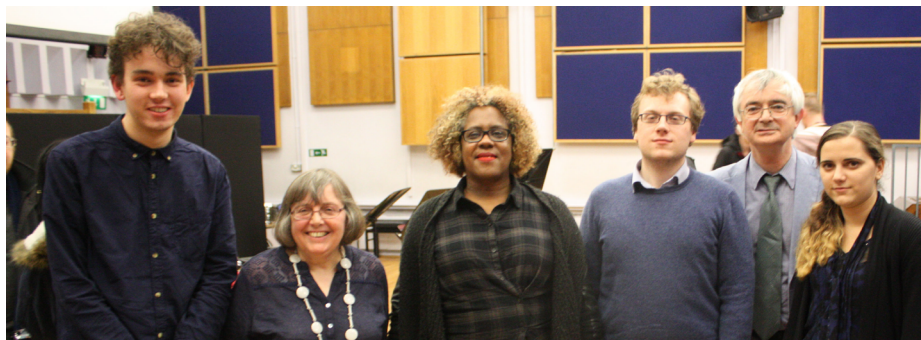
Composition Prize Winners and Adjudicators 2014